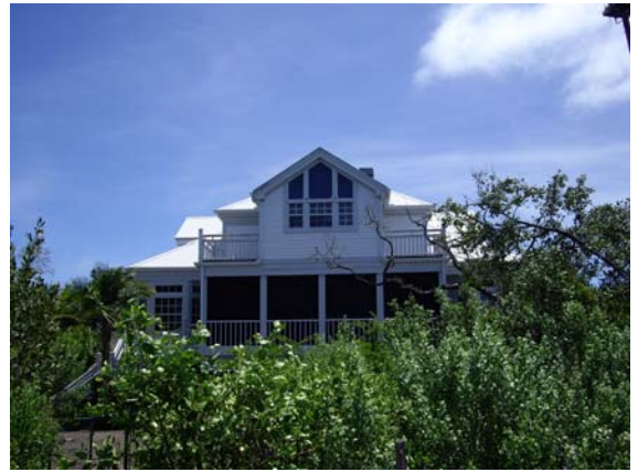
Back of Property