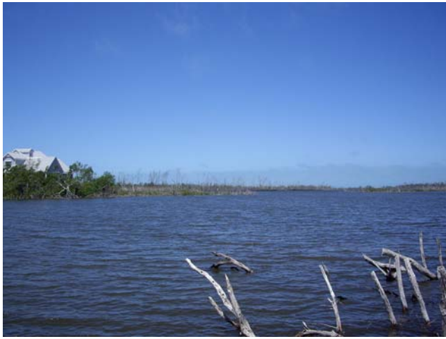
View of Clam Bayou