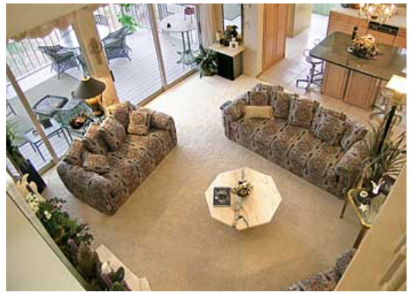
Living Room From Above