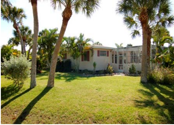
Front of Home