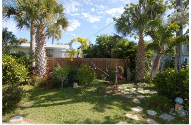
Back of Home